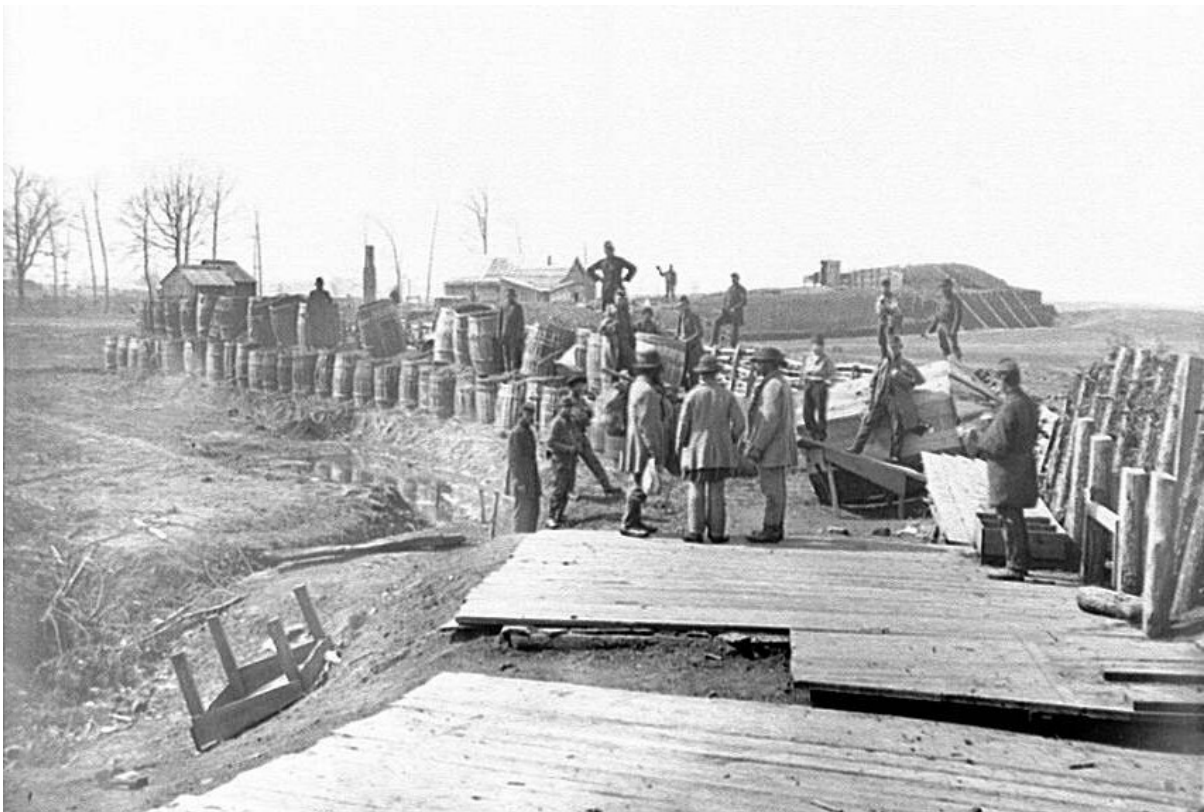
Confederate fortifications, 2nd Manassas, Aug. 28-30, 1862; a great Confederate victory.

THE NEXT CAMP MEETING WILL BE AUGUST 21ST