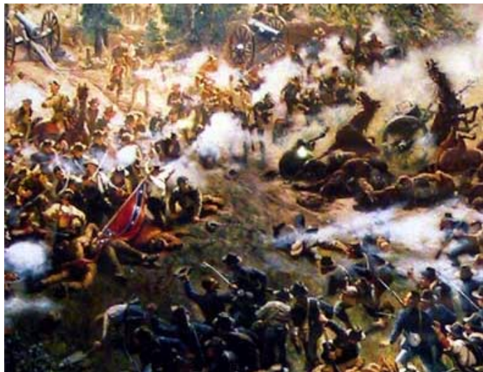
SOUTH CAROLINA TROOPS fighting at the DeGress Battery during the Battle of Atlanta. The Yankees are shown counterattacking in the Cyclorama at Grant Park in Atlanta. The troops fighting alongside the South Carolina troops are the Georgia State Line.