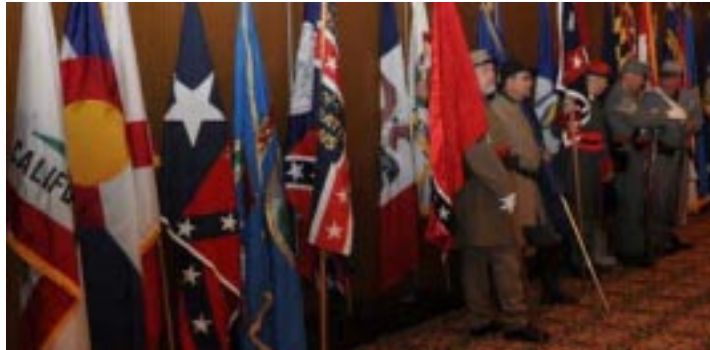
Colors were posted from every division at the Convention.