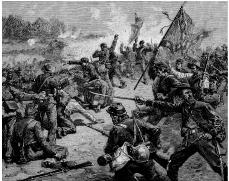
Confederates at the Railroad Cut throwing rocks to stop the enemy. Their ammunition had been exhausted during the fighting.