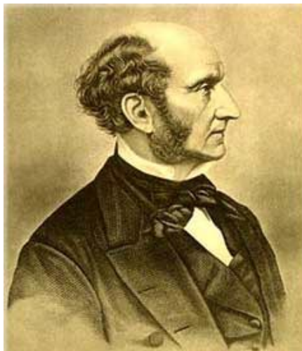
John Stuart Mill