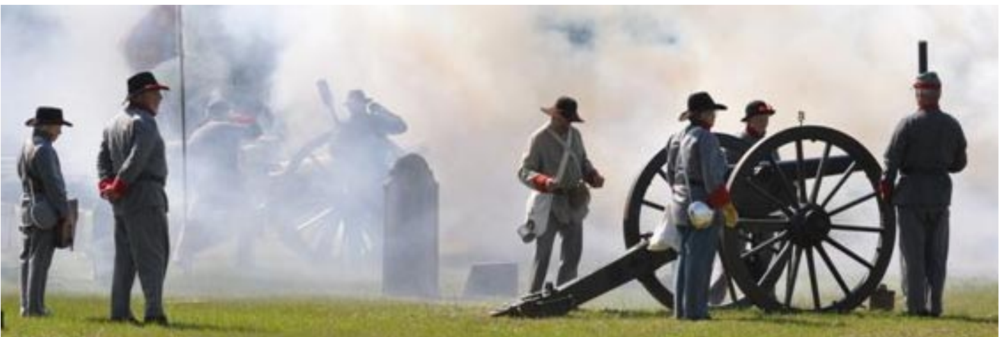
Santee Light Artillery and Marion Light Artillery fire salutes to the fallen.