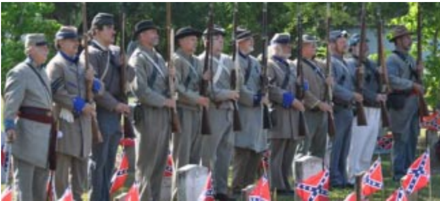
10th SCVI and 27th SCVI Reenactors salute the fallen at "present Arms".

It was a beautiful May morning when almost 200 people gathered to honor their ancestors on Confederate Memorial Day.