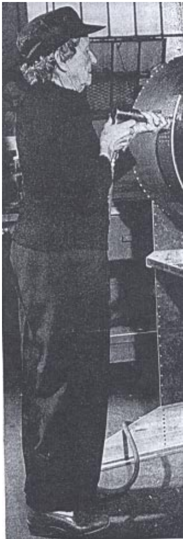
Rosie the Riveter at work at the Bell Aircraft Plant during WWII.