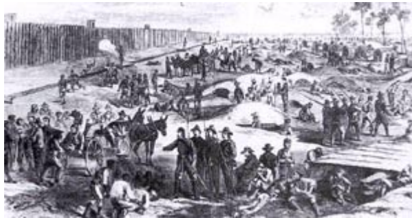
Camp Lawton