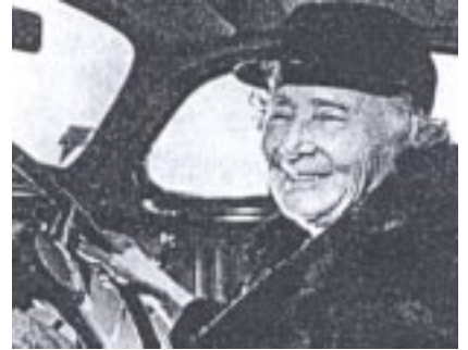
She drove an old Nash coupe to work each day and claimed she was a “very safe driver”.

While at Brenau she met the widower General James Longstreet, the controversial Confederate general from South Carolina and father of her roommate. She later described that first encounter with Longstreet in an unpublished essay, “Wooded to the Warrior’s