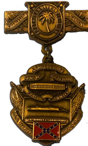
Updated 2022 SCV Medal

2022 SCV Reunion Medal will be created by Mission Awards.