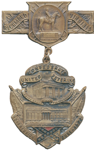
Original 1922 UCV Medal

This year's Reunion Medal is an updated version of a 1922 United Confederate Veterans Reunion Medal from Richmond, VA. Additional medals can be purchased for $25 each on a first come basis. Don't miss your chance to own a piece of SCV history!